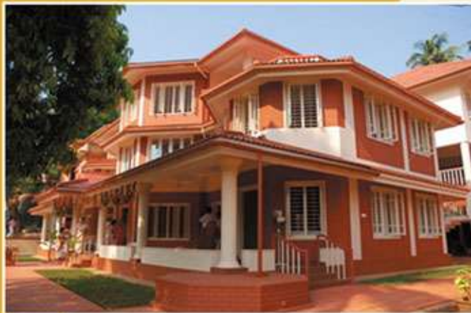
Ashram in Narayan Tapovanam, Trissur, and the Center for Inner Resource Development